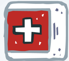
PC anti-virus software