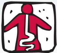
"Gut cam" Ingestible pill video camera to diagnose cancer