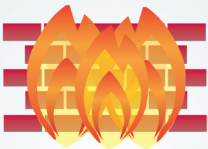
FireWall® internet security software