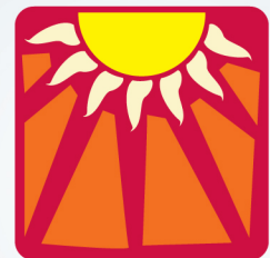
Large-scale solar electricity plant in Calif. Mojave desert