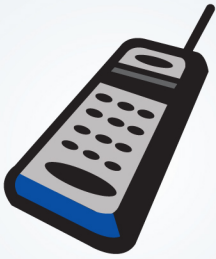
Cell phone technology

All of the following were developed in Israel: