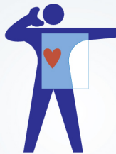
Heart Attack Blood Test Diagnoses By Phone