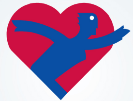
Radiation-free, breast cancer diagnostic test